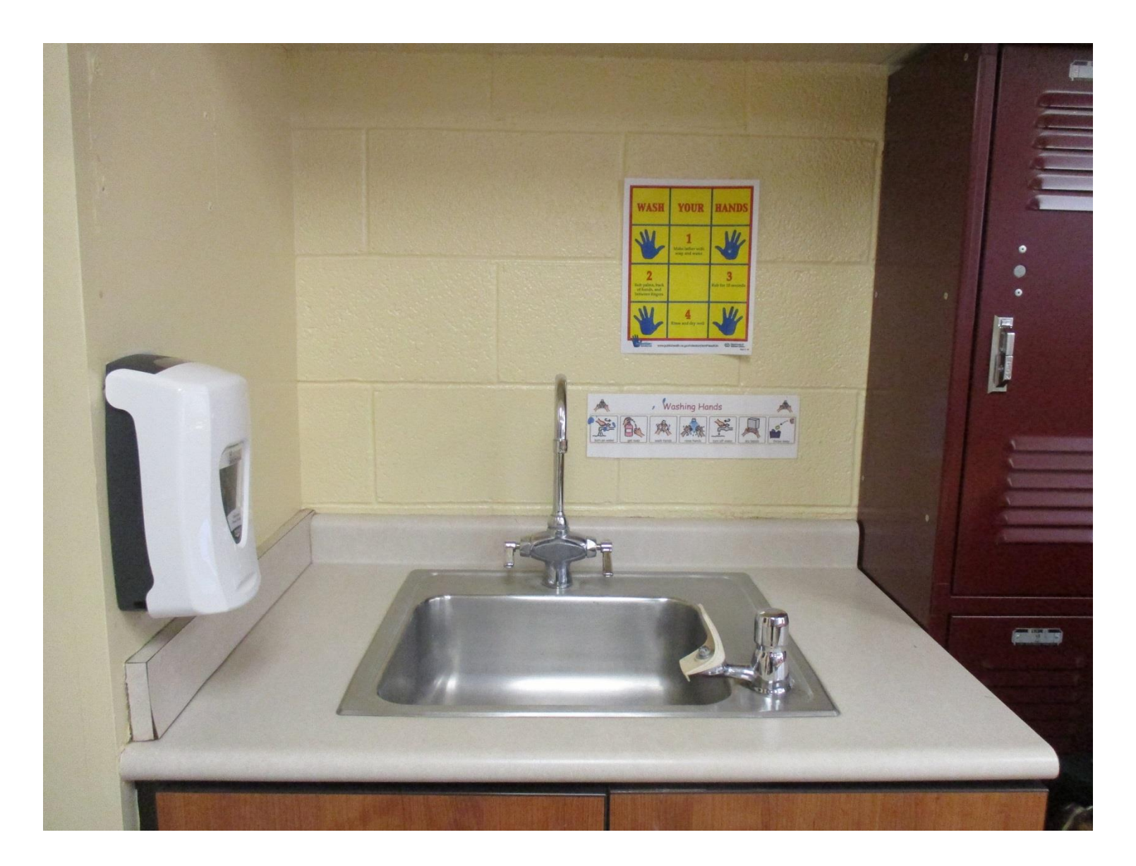
I will wash my hands at school.