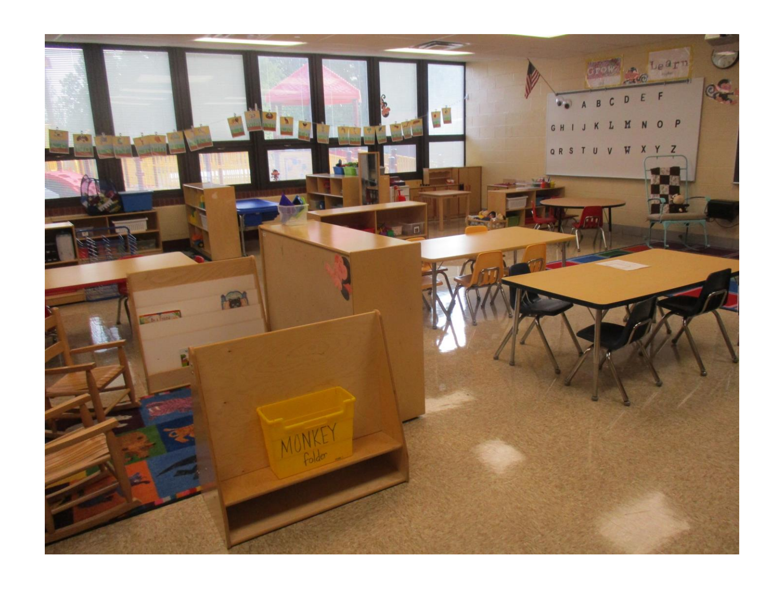
This is what my classroom might look like.