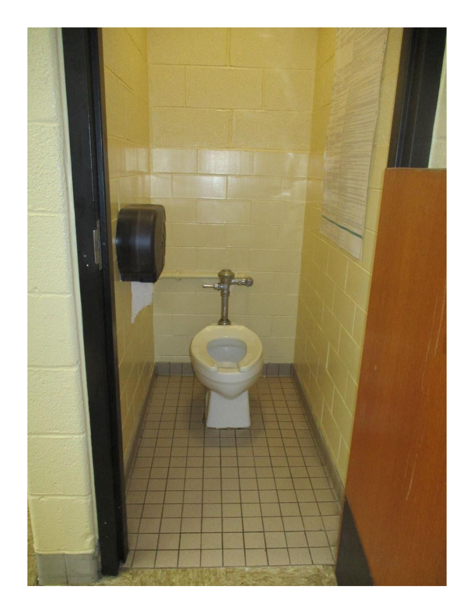
I will use the potty at school. It is just my size.