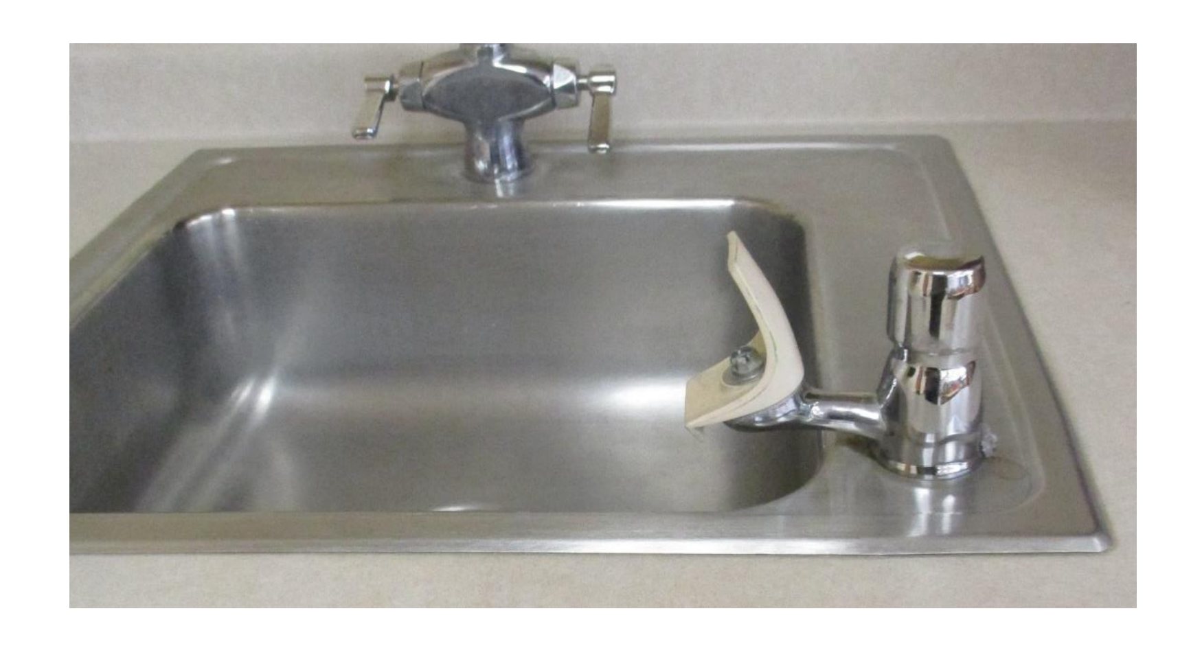
I will get a drink at school.