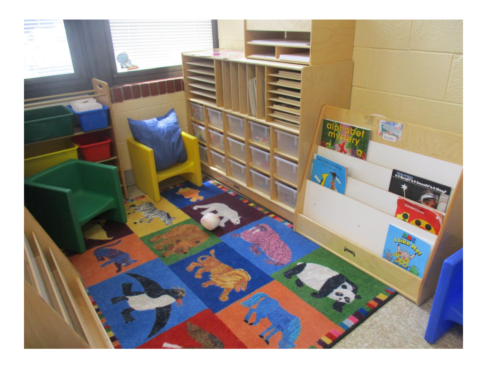
I will read stories, sing songs and play games at school.